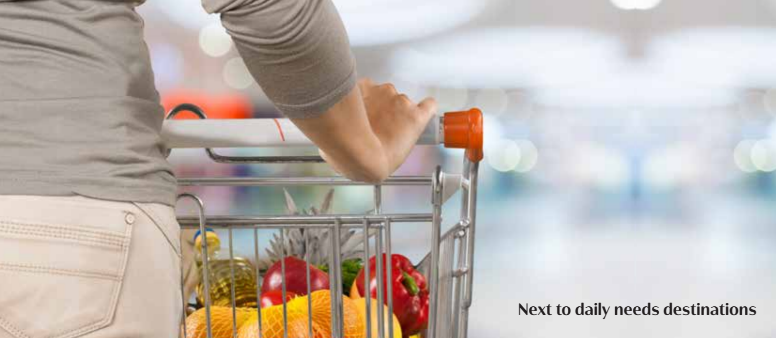
Next to daily needs destinations