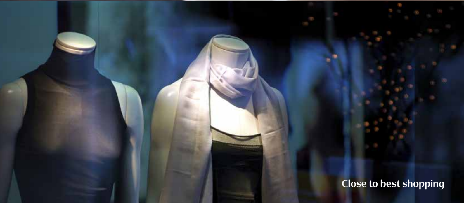
Close to best shopping