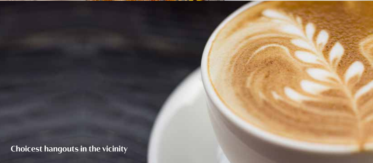
Choicest hangouts in the vicinity